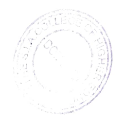
Principal PRINCIPAL The S.I.A. Coll Control Scient Education DOMBIVLI (E)