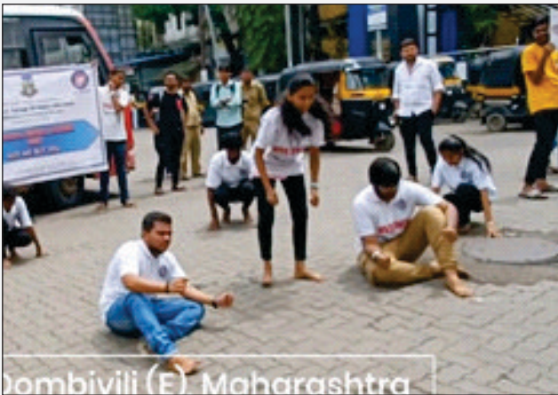
Dombivli (E) Maharashtra