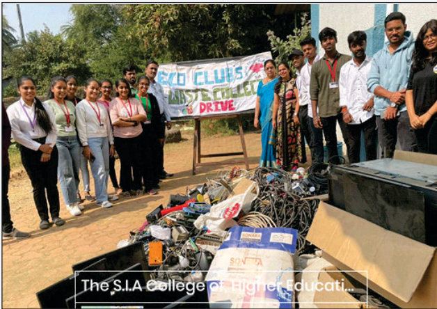
The S.I.A College of Higher Educati...