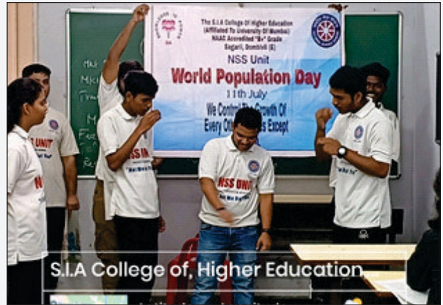
S.I.A College of, Higher Education