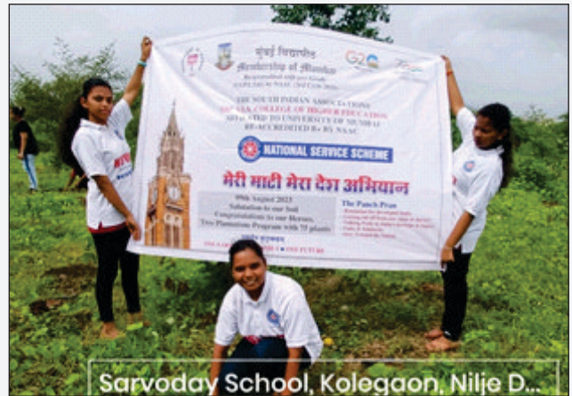
Sarvoday School, Kolegaon, Nilje D...