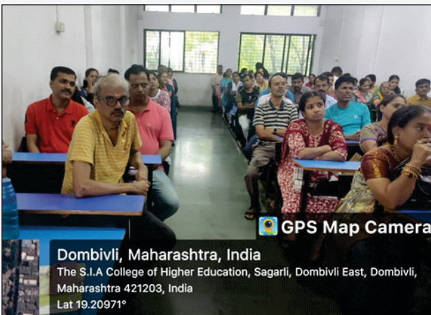
Dombivli, Maharashtra, India The S.I.A College of Higher Education, Sagarli, Dombivli East, Dombivli, Maharashtra 421203, India Lat 19.20971°